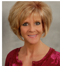
Moira House Memphis, Tennessee

Kansas City Business Journal Top 100 Influential People - Winner